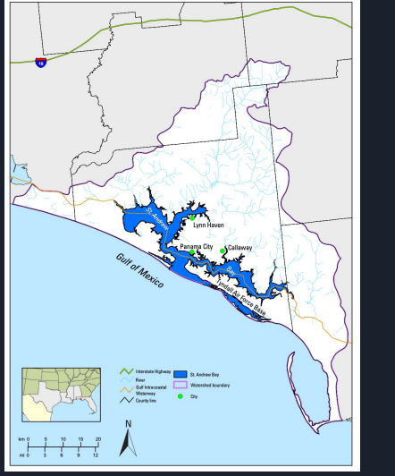
USGS Natural Watershed Boundary